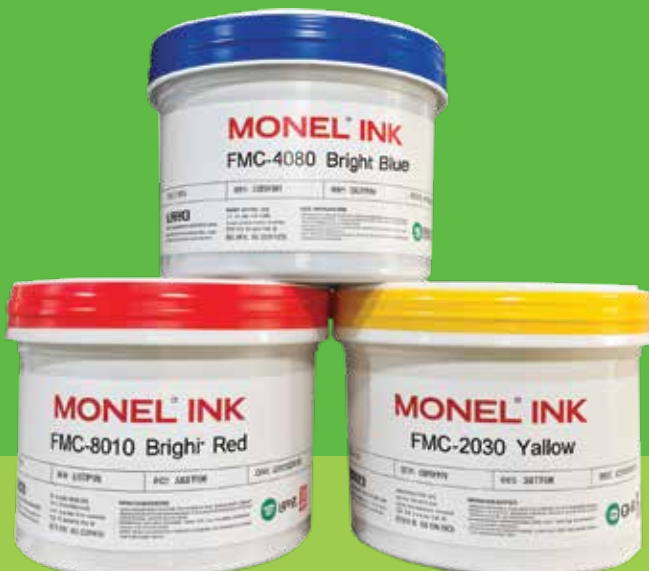
Fabric label Printing INK (PFL)