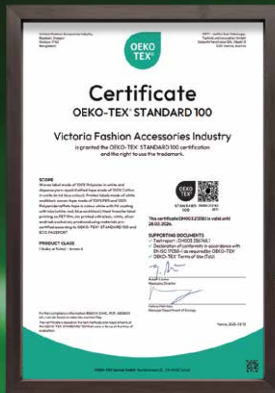
Oeko-Tex® (PFL – Cotton Label, Heat Transfer Label & Woven Label)