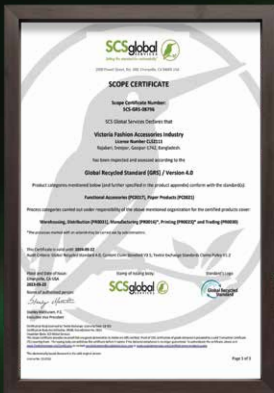
GRS (Global Recycled Standard)