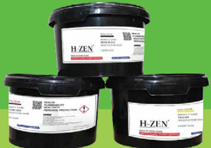
Fabric label Printing INK (PFL)