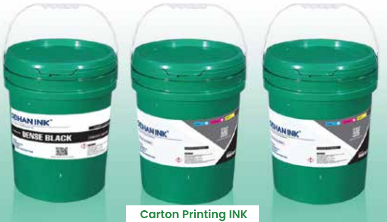
Carton Printing INK