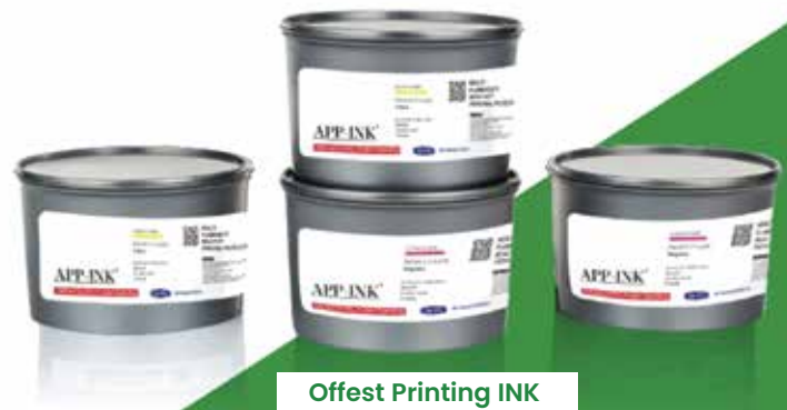
Offset Printing INK